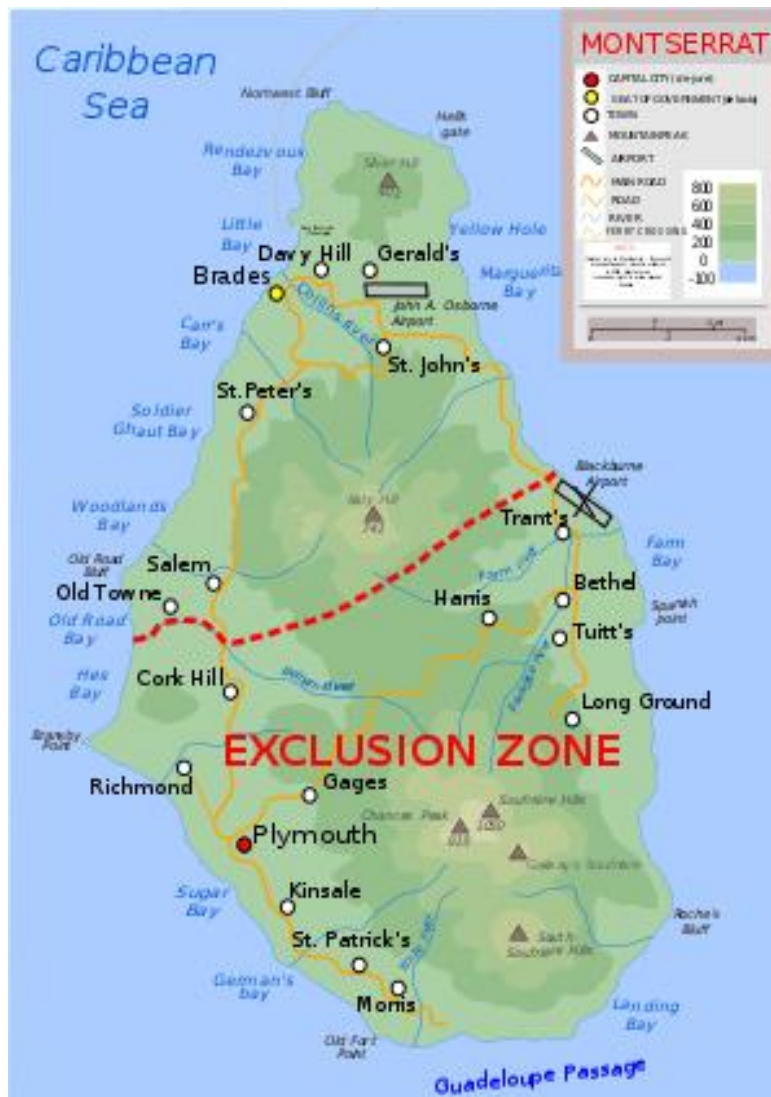
Figure 1 – General Map of Montserrat

Montserrat 1 is a mountainous little gem in the Lesser Antilles chain of islands nestled between Antigua and Barbuda, St Kitts and Nevis and Guadeloupe. Montserrat has a population of 4,950 (2014 estimate) with a land area 16 km long and 11km wide. It has a rich mixture of African, North American, and European influences. The official language of Montserrat is English. Montserrat was very well integrated in the 1990's with a population peaking at around 14,000; with a regional airport and cruise ship terminal with a capacity for handling 45,000 tourists per year.