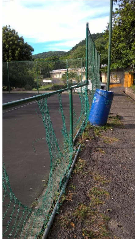
The 2-photo spread above are from the courts at salem.