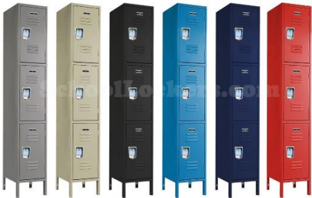
Figure 1 The photo below is an example only as to the expectations of this tender