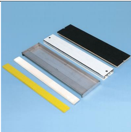
Take Off Board Sensor