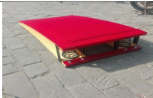
Long Jump Spring Board