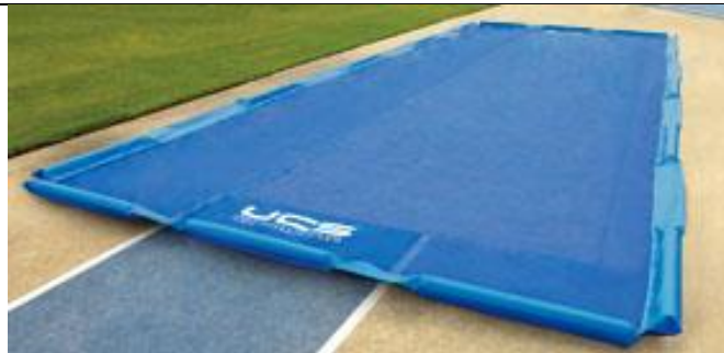
Long Jump Pit cover