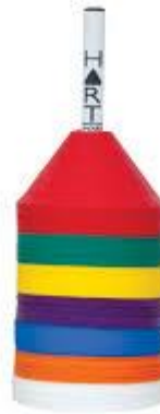
Field Marker cones