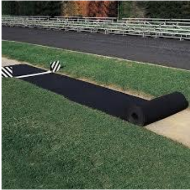
Long Jump Portable Runway