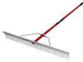
Long Jump Rake