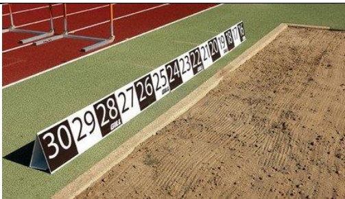
Long Jump Distance Marker Board