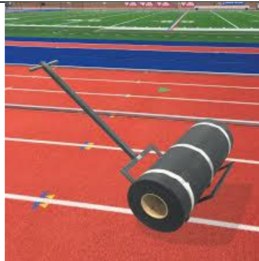
Long Jump Runway Cart